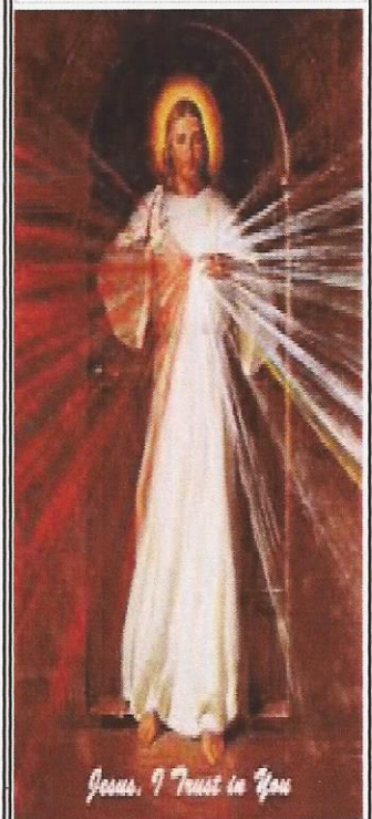
Jesus. I Trust in You

The Sacred Heart Parish acknowledges the Kamilaroi people, the traditional owners and custodian of the land on which we stand. We pay our respects to them and for their care of the land. May we walk gently and respectfully upon this land. And we pray that peace and harmony prevail.