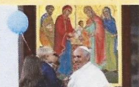
THE JOY OF LOVE POPE FRANCIS

APOSTOLIC EXHORTATION ON LOVE IN THE FAMILY