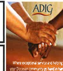
Where exceptional service and helping your Diocesan community go hand in hand.

SATURDAY VIGIL MASS: WINTER MONTHS MAY TO AUGUST 5:30 PM