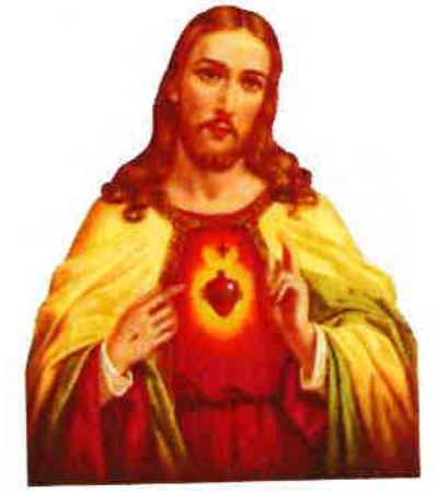
FRIDAY 19 June - Feast of the Sacred Heart

SOCIAL DISTANCING Please observe social distancing rules. Allowing four square metres per person. (1.5 metres from each other). This will apply for the foreseeable future. Hopefully after July 1 restrictions on numbers may be lifted.