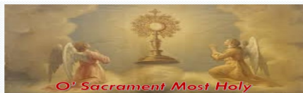
O' Sacrament Most Holy O' Sacrament Divine. All Praise and all Thanksgiving, be every moment Thine...

Baptism (Saturday only) 11am; Marriages and Funerals by Appointment