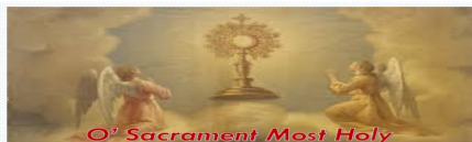
O' Sacrament Most Holy O' Sacrament Divine. All Praise and all Thanksgiving, be every moment Thine...