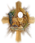
MASS INTENTIONS FOR THE WEEK

MISSION: To know Christ more, His life and His teachings. To imbibe Christ's message of love and service. To try to share generously what graces and blessings we have and to be instruments of the Gospel message.