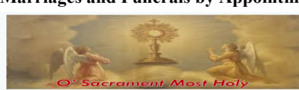
O' Sacrament Most Holy O' Sacrament Divine. All Praise and all Thanksgiving, be every moment Thine...