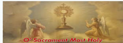
O' Sacrament Most Holy O' Sacrament Divine, All Praise and all Thanksgiving, be every moment Thine...

Baptism (Saturday only) 11am; Marriages and Funerals by Appointment